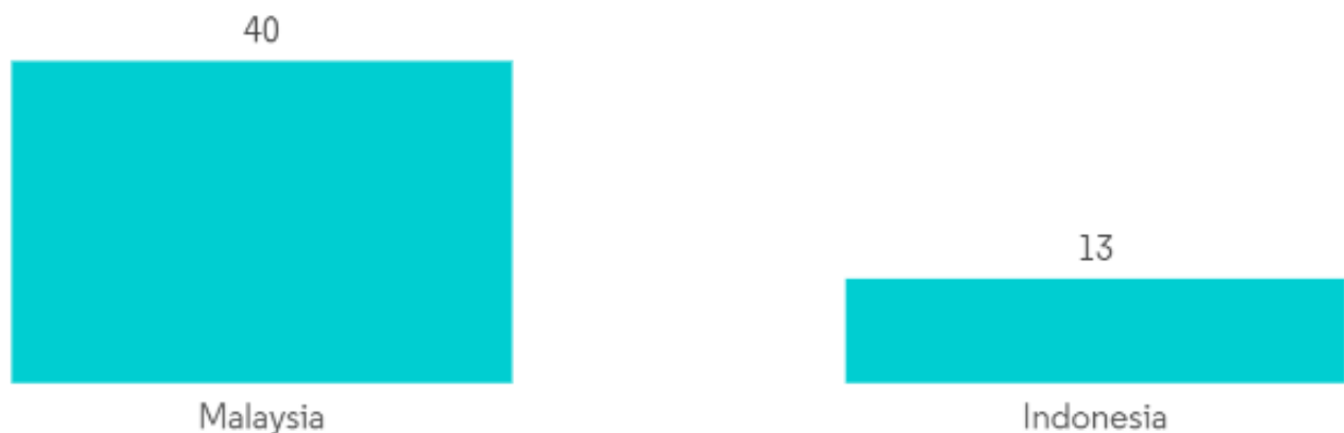
Figure 2. Malaysia and Indonesia's share of Sukuk is in percent

Takaful, Sukuk and Islamic funds are among the leading Islamic financial products in the Asia-Pacific region. Bangladesh, Malaysia, Maldives, Mauritius and Indonesia have leading positions. Malaysia and Indonesia are among the top countries with sukuk worth $279 billion and $84 billion last year, respectively. These trends represent an established and ever-expanding Islamic finance market in the Asia-Pacific region.