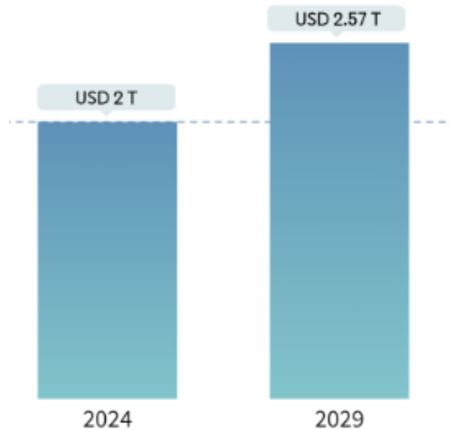
Figure 1. Islamic finance market growth forecast in the Middle East

The size of the Middle East Islamic finance market is estimated at $2 trillion in 2024 and is expected to reach $2.57 trillion by 2029.