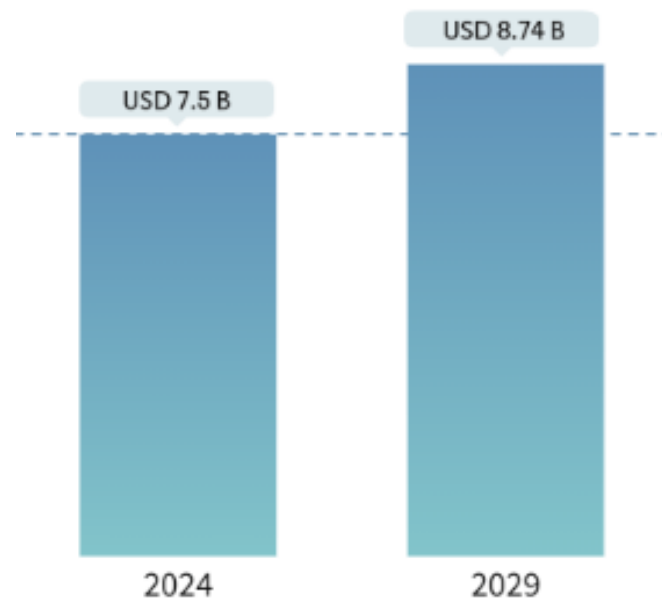
Figure 3. Islamic finance forecast for the coming period

The UK is a relatively minor player in global Islamic banking assets. However, the UK is a major player in Europe, accounting for 85% of all Islamic banking assets in Europe and having the largest Islamic banking assets in Europe (excluding Turkey). The UK has seen rapid growth in Islamic finance over the past decade as the government has been very active in promoting and promoting the sector.